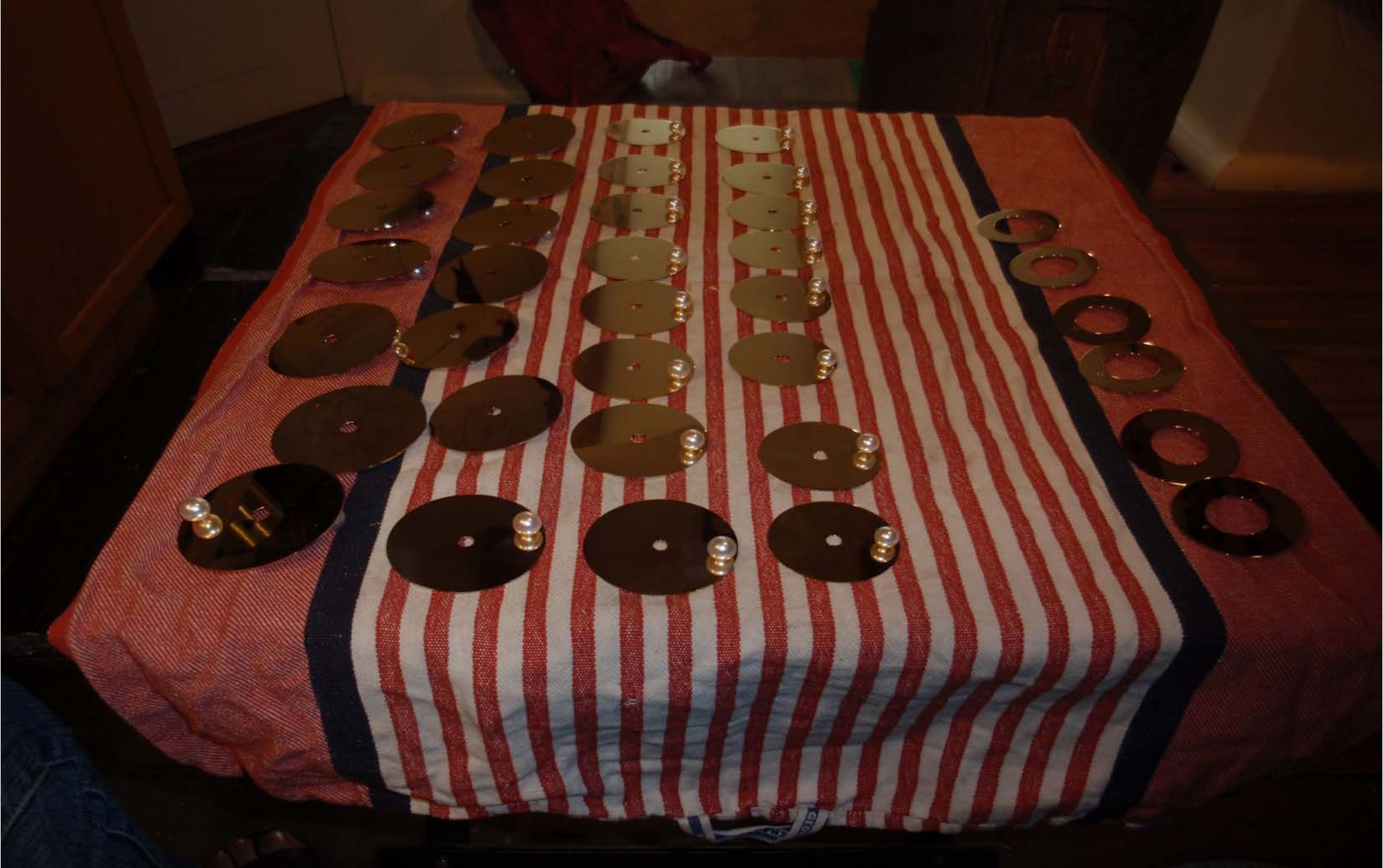
"Day" before the candlestick is assembled.